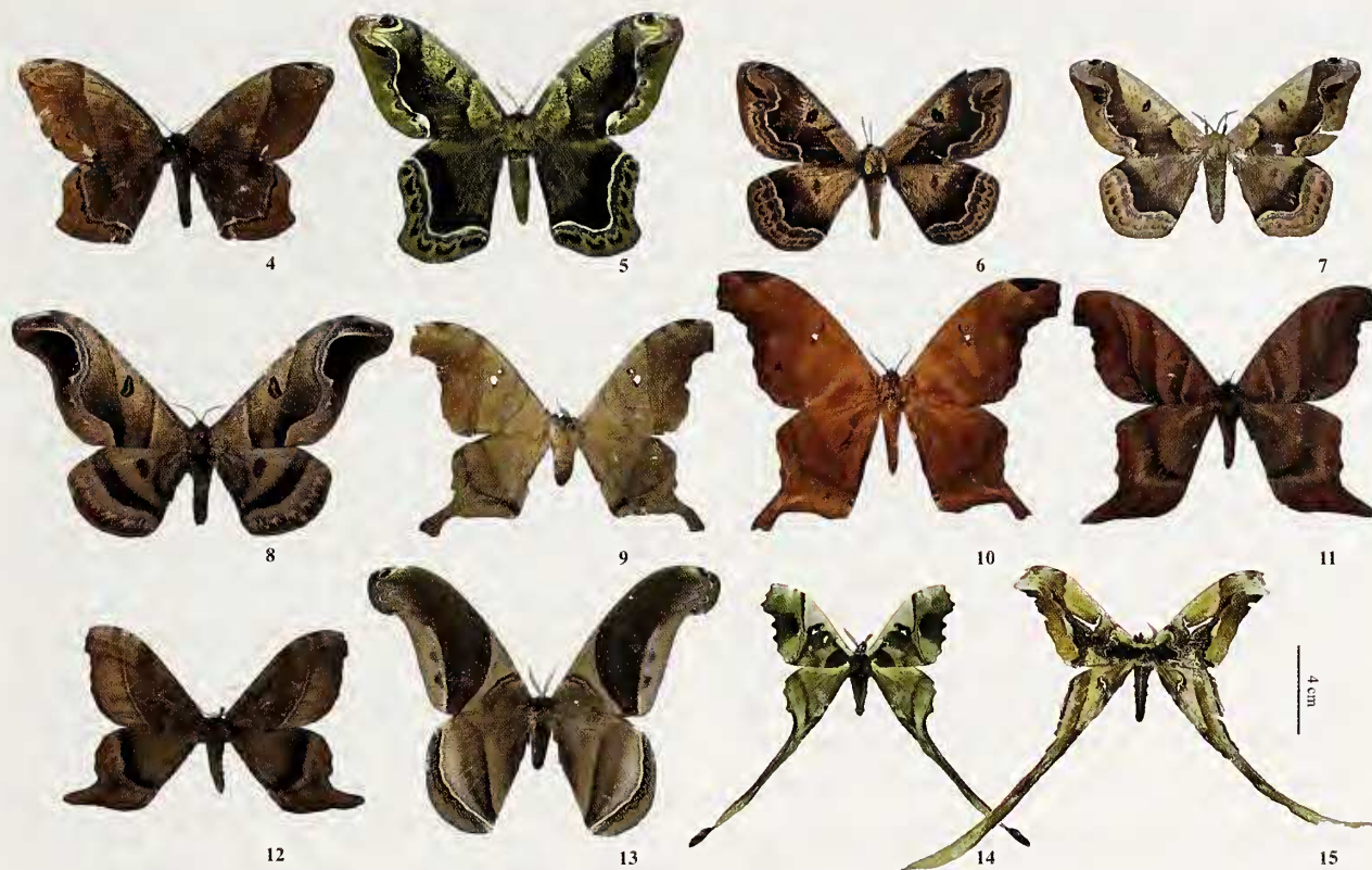
FIGS. 4–15. Figs. 4–9. Arsenurinae of Rio Grande do Sul, Brazil (male dorsal view). 4. Arsenura armida . 5. Arsenura biundulata . 6. Arsenura orbygniana . 7. Arsenura xanthopus . 8. Caio romulus . 9. Dysdaemonia brasiliensis . Figs. 10–15. Arsenurinae of Rio Grande do Sul, Brazil (male dorsal view). 10. Titaea tamerlan tamerlan . 11. Paradaemonia meridionalis . 12. Paradaemonia thelia . 13. Rhescyrtis pseudomartii . 14. Copiopteryx southonaxi . 15. Copiopteryx derceto .